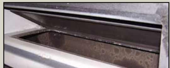
Damper Door Open - Cam active