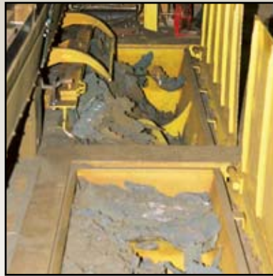
Slagger Blade pushes the slag into the Slag Bucket (optional)