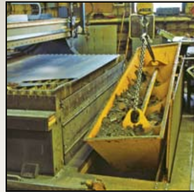
Slag Bucket (optional) can be removed for emptying at a convenient time