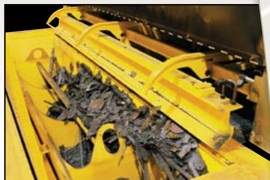
Table Frame and Support Surface: Maximum work piece thickness for the standard table is 4 inches (100mm). Tables for thicker material are available. The table can be any size and corresponds to the cutting capacity of the cutting machine. The table arrives at the end user assembled in modules for final assembly on-site.

Slag Pusher Blade Assembly: Each table is divided into lengthwise bays by the side wall and duct modules. A Slagger unit runs within each lengthwise bay. Each Slagger unit travels the entire length of the table and pushes slag and small parts out of the table into a collection area or an optional slag bucket.