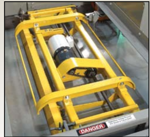
Slagger Pusher Blade Mechanism

The pusher blade is propelled with a positive rack and pinion drive. To clean the table, the operator simply runs the cutting machine into its park position, which sets the safety circuit. The Slagger drive is then turned on, moving the pusher blade unit forward, pushing the slag ahead of it. Utilizing a unique design, the Slagger pusher blade opens and passes under each of the downdraft zone swinging dividers automatically as it passes along. Once the Slagger has passed, the swinging divider returns to its vertical position to restore the smoke removal airflow capability during cutting. When the unit reaches the end of the table, the slag is pushed outside of the table for disposal.