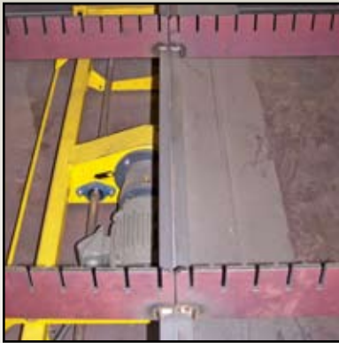
Slagger Blade during the cleaning cycle (Shown moving under a swinging zone divider)